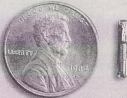
The Snagg chip.

For more, contact Snagg at (760) 737-8628 or visit snagg.com . VF